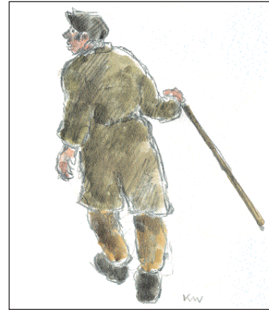
Sir Kyffin Williams "Farmer with stick" Pencil and watercolour 12in x 16in