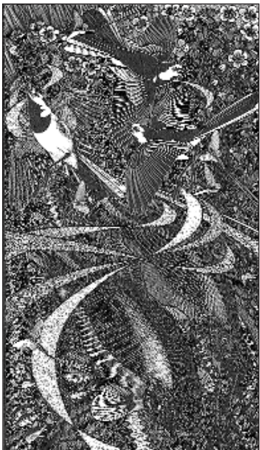
Colin See-Paynton "Wagtails and Tench" Wood engraving 6in x 10in