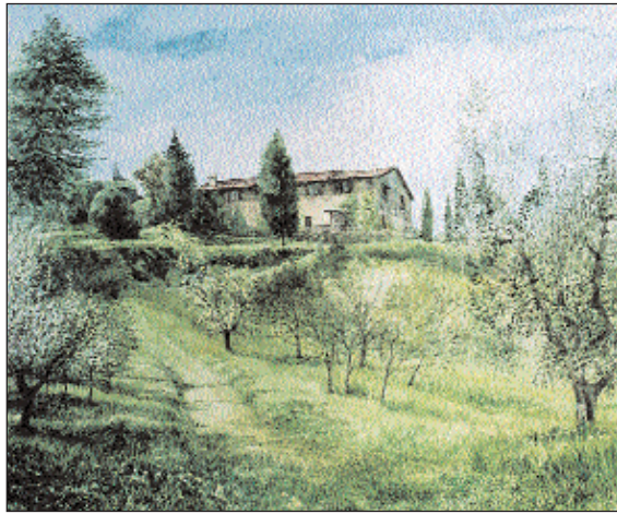
Jane Carpanini "Casa di Luna" Watercolour 10 1/2in x 13in