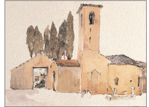
Iola Spafford "Church near Casole d'elsa Tuscany" Watercolour 17 1/2in x 21in

Please come and please bring or tell your friends